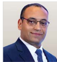
Dr. Mohamed Madbouly UAE